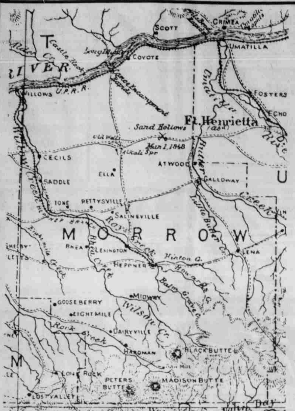
Old Army map of Morrow Co. shows early settlements