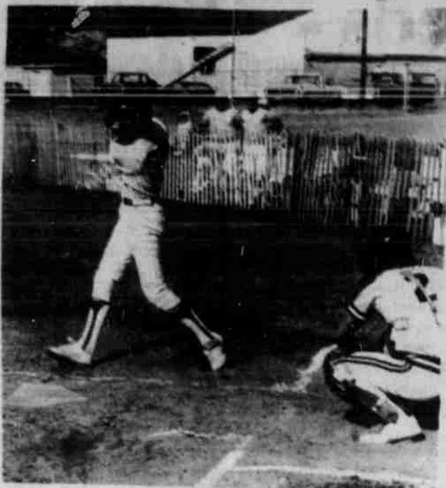
Heppner batter gets hit against Riverside

Heppner and Umatilla both took good shots at winning their Columbia Basin Conference baseball game at Umatilla Saturday afternoon, but both ended up as losers to the weather after being tied 8-8 in the top of the fifth inning.