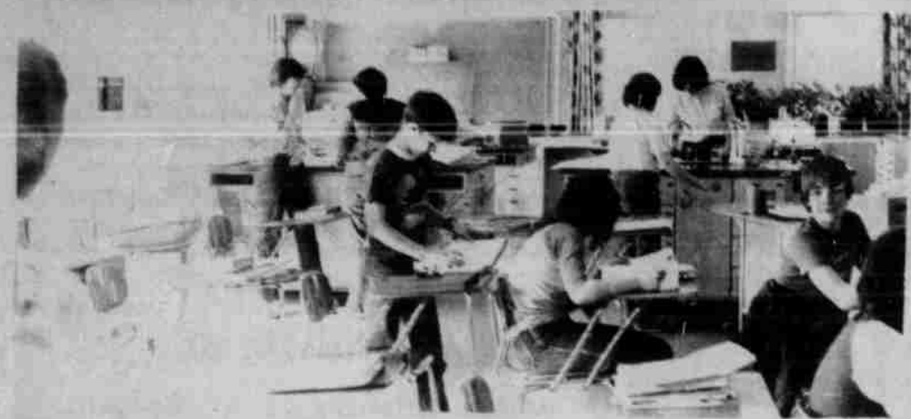
Heppner Elementary science students prepare projects for Science Fair

Students at Heppner Elementary School will present a Science Fair on Tuesday, April 19. Projects will be on display for public viewing in the school's multi-purpose room from 6:30 to 8:30 p.m.