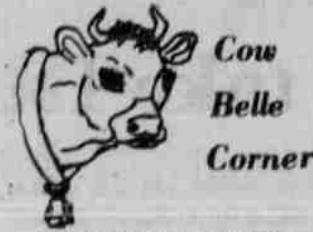
Cow Belle Corner