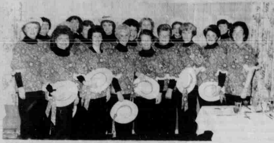
Blue Mountain Chapter of Sweet Adelines