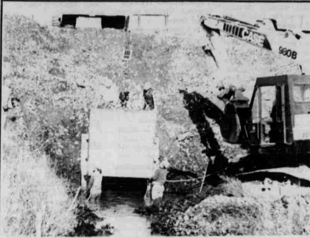
Workers closed the diversion pipe at Heppner's Willow Creek Dam last Wednesday morning.