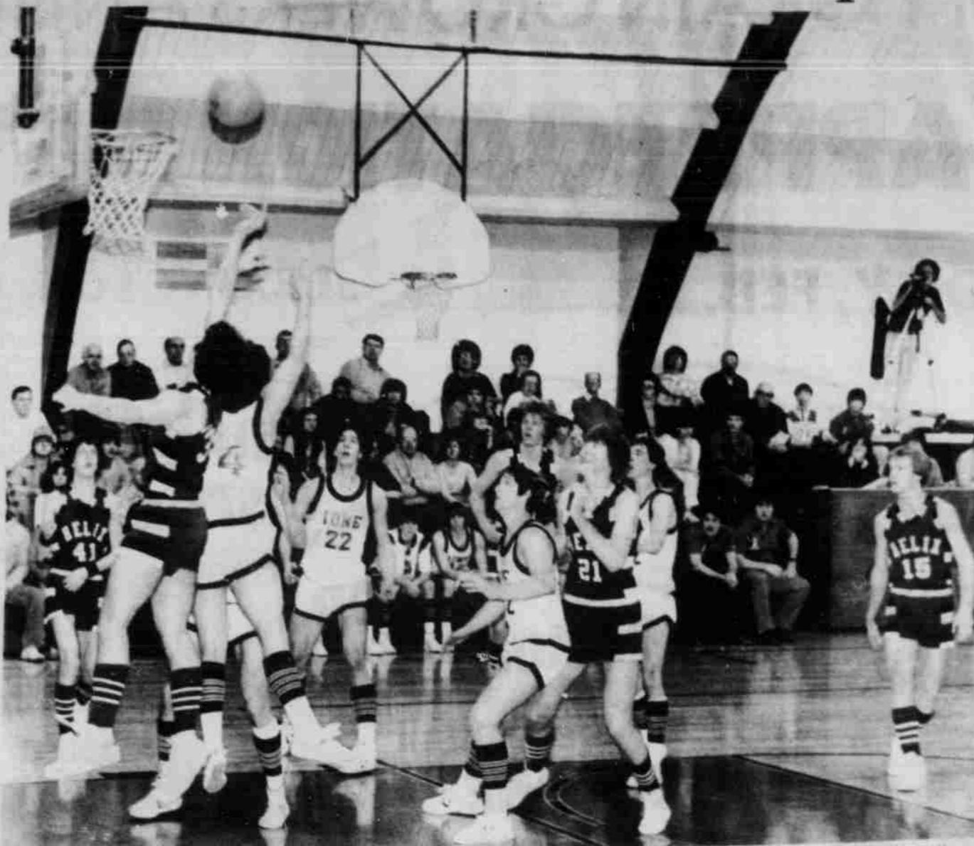
Ione and Helix players go for rebound