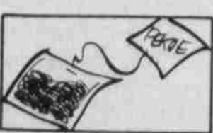
Cold tea is a good cleaning agent for varnished floors or woodwork of any kind.

The Morrow County Historical Society reminds those who plan to submit stories and/or purchase a copy of the book "Morrow County's History," to do so soon. The publishers require a certain number of stories and book orders before they can begin printing.