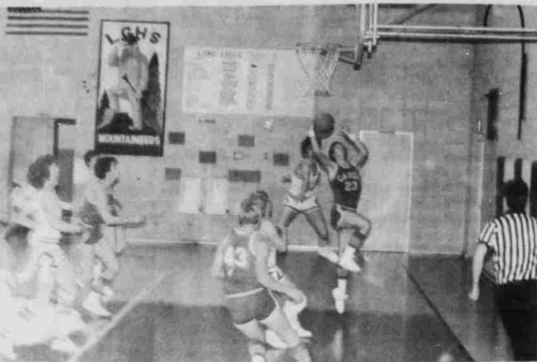
Ione player goes for the basket at Long Creek tourney