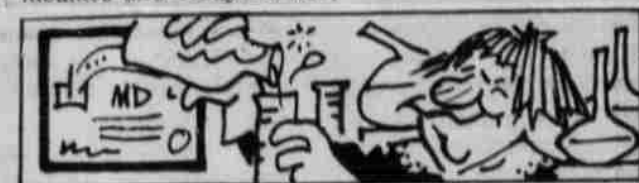
A Dutch physician is said to have invented gin in the seventeenth century as a medicinal.