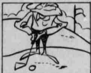
North Carolina, often called "Golf State USA," has some 330 golf courses.

NOW, THEREFORE, by virtue of said Execution and Judgment and in compliance with the command of said