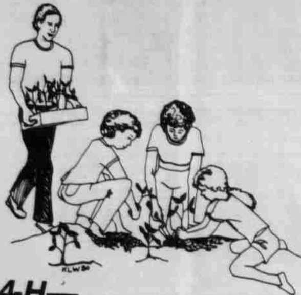
4-H— a family affair