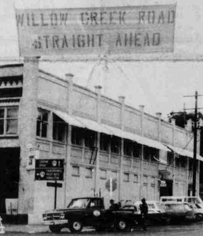
Large banner over Main St. will help hunters find Willow Creek Road.

Last Monday, Sept. 27 a bright blue and orange banner became a new addition to Heppner's Main Street.