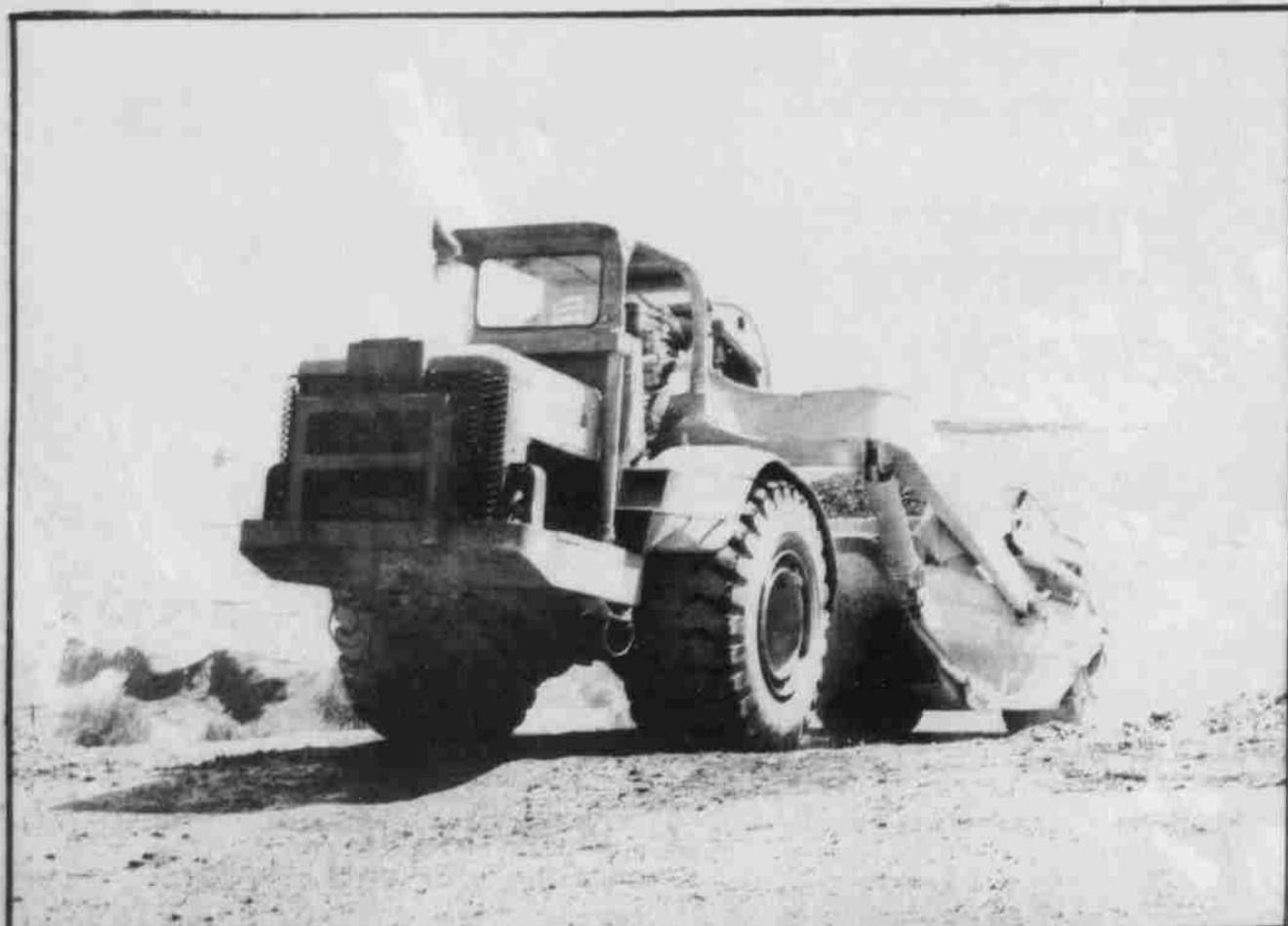
Large earth movers such as this make continuous circle bringing crushed rock to top of dam for deposit.