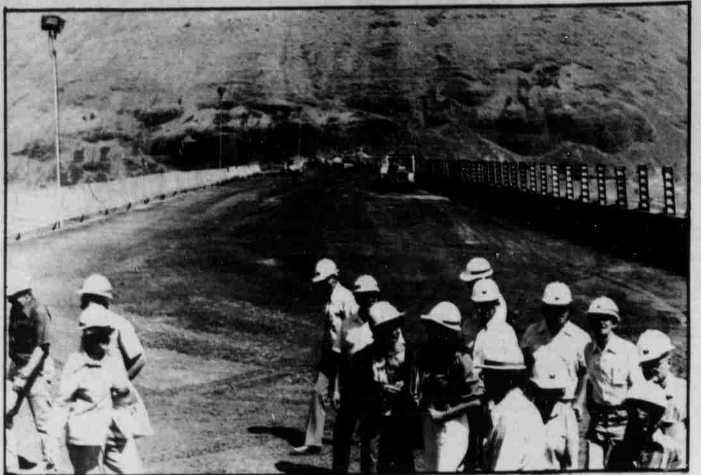
Visitors stand on top of dam structure, which is now over 100 feet high. Final structure will be 169 feet high.