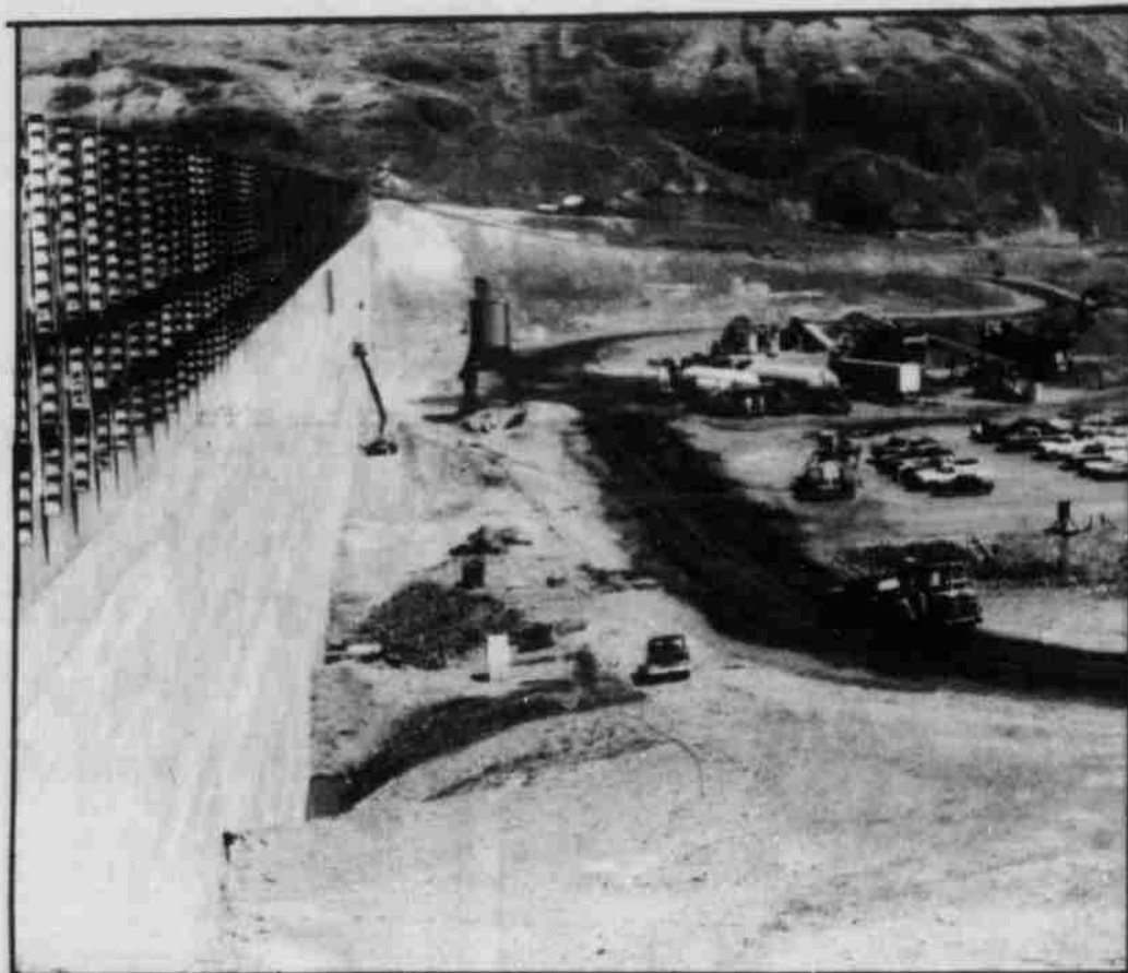
Water will one day cover this side of dam. Face of dam is smooth concrete.