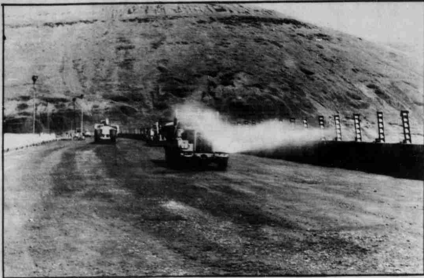
Water truck on top of dam sprays deposited concrete continuously to insure proper bonding of material