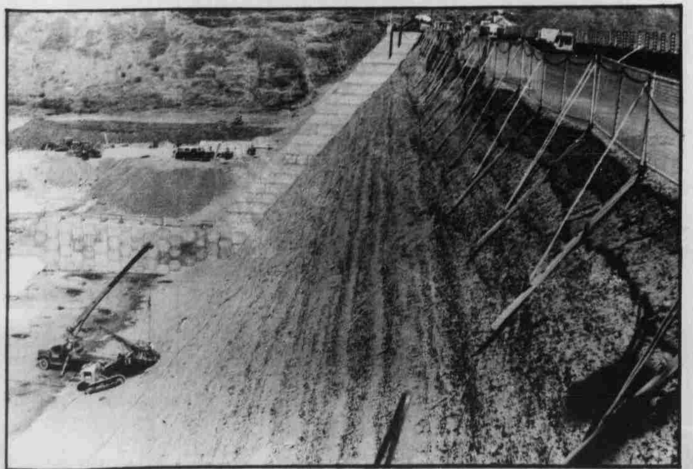
Side of dam facing town Dam is sloped and has a rough texture.