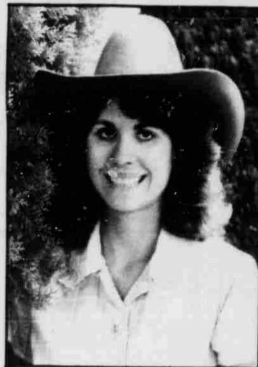
PRINCESS ANNETTE WILGERS