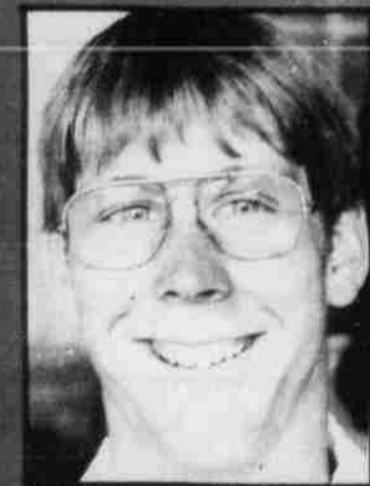
Darryl Bigelow Sales & Service