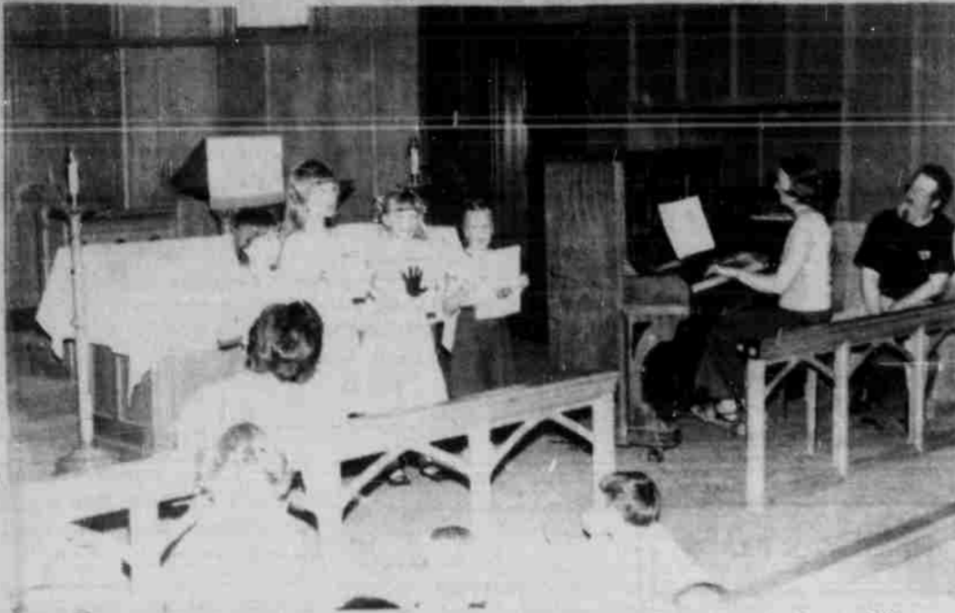
Vacation Bible School students entertain overflow crowd at All Saint's Episcopal Church in Heppner Friday night. The evening program concluded the annual week-long Bible school.