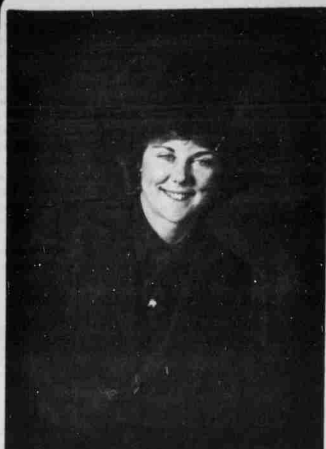
Morrow County 1982 Junior Rodeo Queen