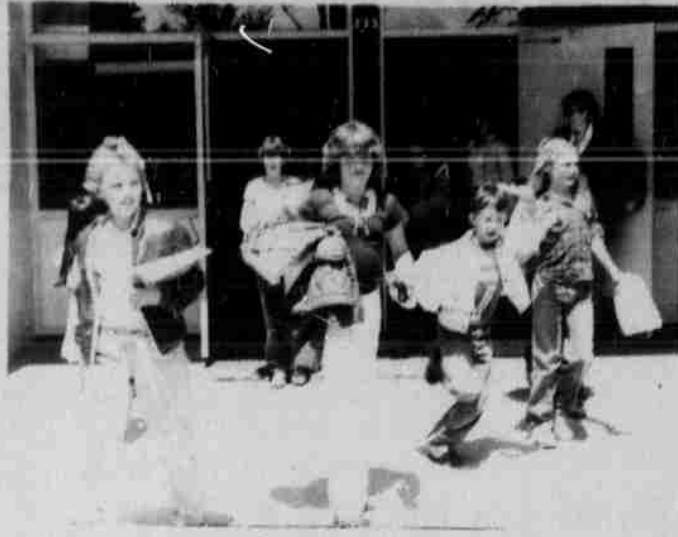
Heppner Elementary students hurried out the door last Wednesday as summer vacation began