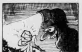
Coal and diamonds are made of the same chemical element - carbon.

All women attending are asked to bring a guest and a salad, the spokesperson added.