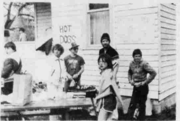
HHS band sold hot dogs and sodas.