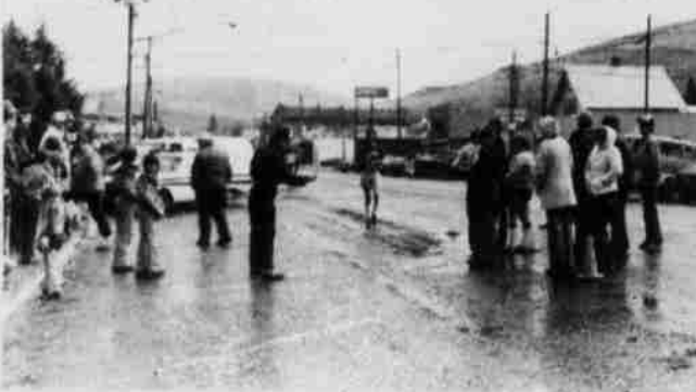
The finish line...Looking good!