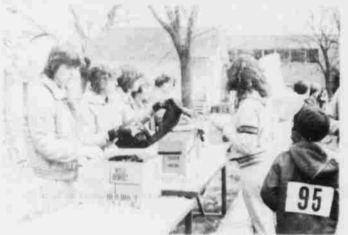
T-shirts were awarded to all finishers.