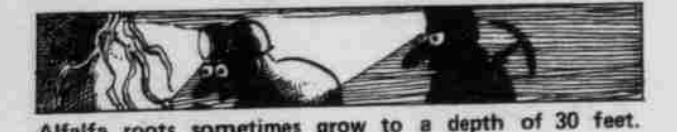
Alfalfa roots sometimes grow to a depth of 30 feet.

This is a part of a statewide campaign funded by Oregon Beef producers and leaders to inform consumers on the nutrition and value of beef.