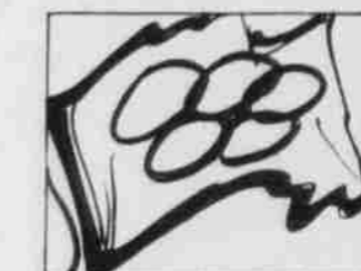
The first American to enter the Olympic Pentathlon was George Patton, later General Patton.

The Mustang JV's, now 3-1 for the season, don't play again until Jan. 8 when they travel to Boardman to face the same Riverside ball club.