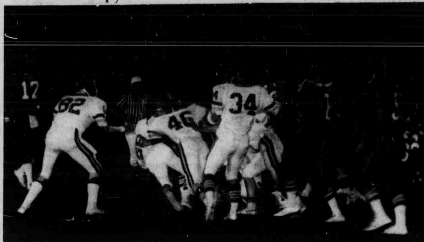
Mustangs in action against Huskies