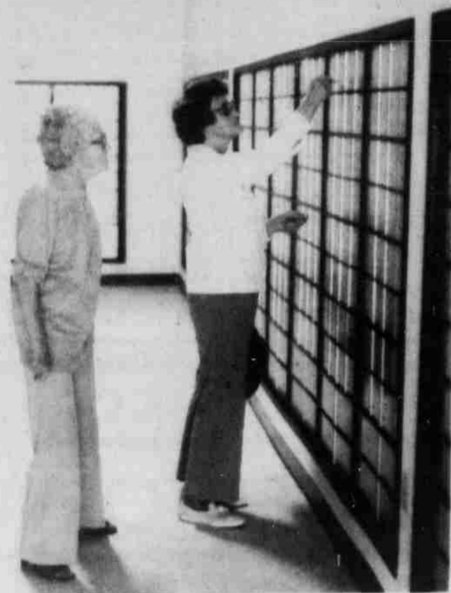
Postal Patrons search for their new boxes

The new Heppner Post Office opened for business Monday, Sept. 14. The new location is adjacent to the old post office building on Main Street.