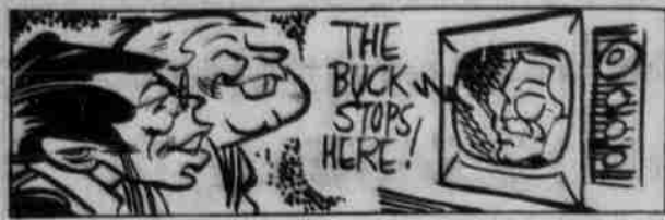
Transcontinental television was inaugurated Sept. 4, 1951, when President Harry Truman addressed the Japanese Peace Treaty Conference in San Francisco.