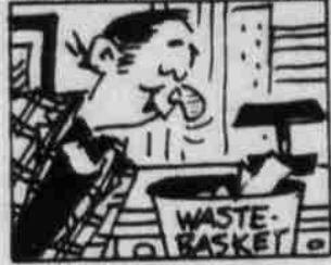
A sheet of fabric softener in the wastebasket helps give a room a nice soft smell in a hurry.