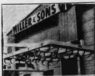
Hydraulic Bale Forks

MILLER & SONS WELDING ALL STEEL TRUCK BEDS