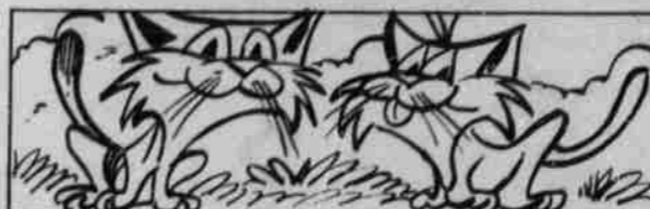
A group of kittens is known as a kindle.