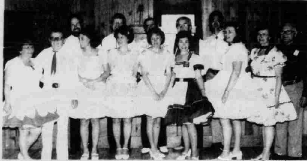
Guests from the Olympia Grand Squares Club decked out in their buttons and bows during the dance.