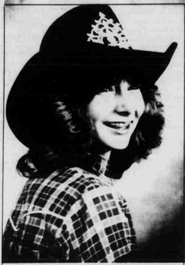
Morrow County 1981 Junior Rodeo