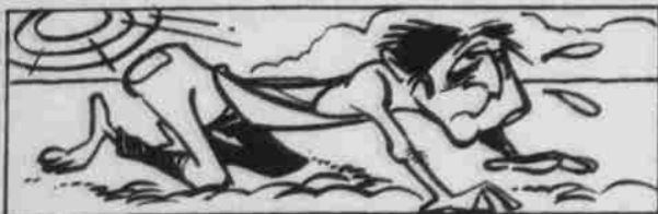
The Western Hemisphere's hottest average summer temperature occurs in Death Valley, Calif., -98° Fahrenheit.

of track warm-ups, hooded sweatshirts and sweat pants, worth a total of approximately $150.00. These are bright red with white lettering indicating Heppner Junior High on them. The students, staff and administration of Heppner Elementary would appreciate any information leading to the return of these items. If you are aware of the possible whereabouts of these or other pieces of clothing or equipment, please call 676-9128. Heppner Elementary School