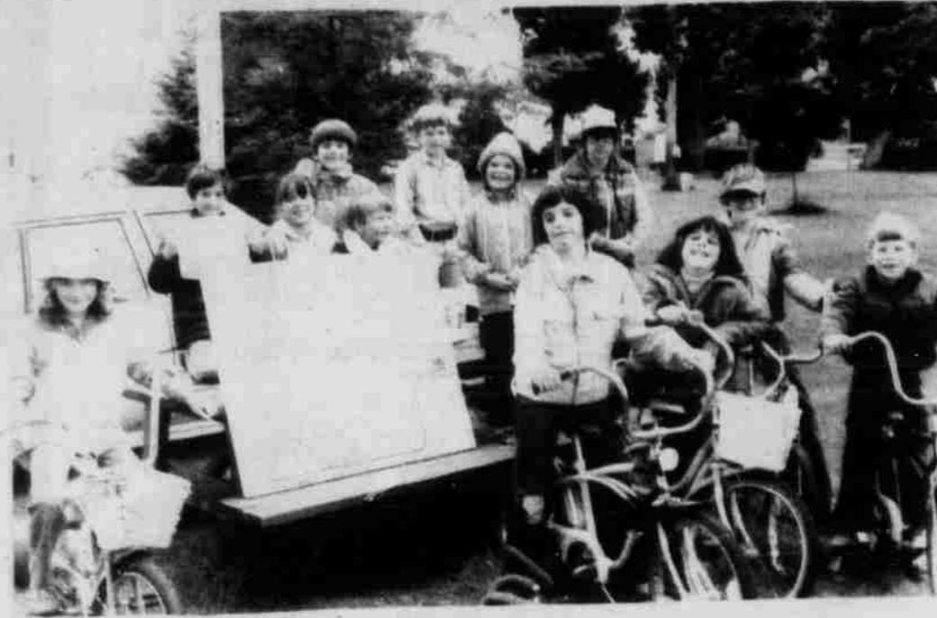
Cystic fibrosis bike-a-thon contestants