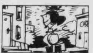
The first co-ed in the U.S. was admitted to Oberlin College, Ohio, in 1833.

Fri., May 29 - Free Blood Pressure Clinic. Immunizations, Lexington Health Dept. Office, 8 a.m. to noon, 1 to 4 p.m.