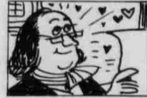
Benjamin Franklin said "He that falls in love with himself will have no rivals."