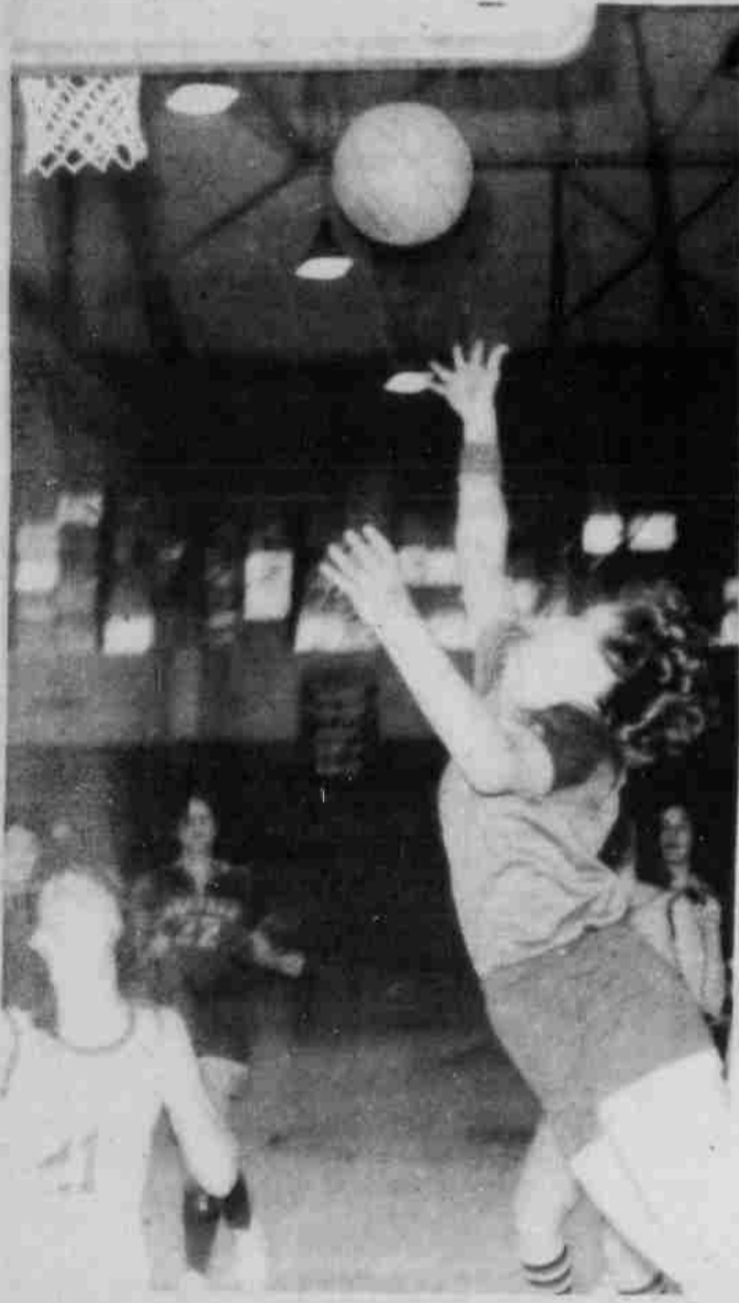
Unidentified Fillie goes for a bucket against Wahtonka