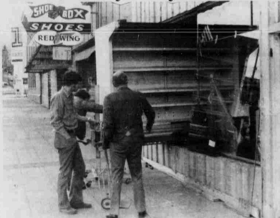
Workers moved food cases into S and J Market in Heppner last week. It became necessary to remove the front window of the store when it was discovered that the cases were too big to fit through the door.