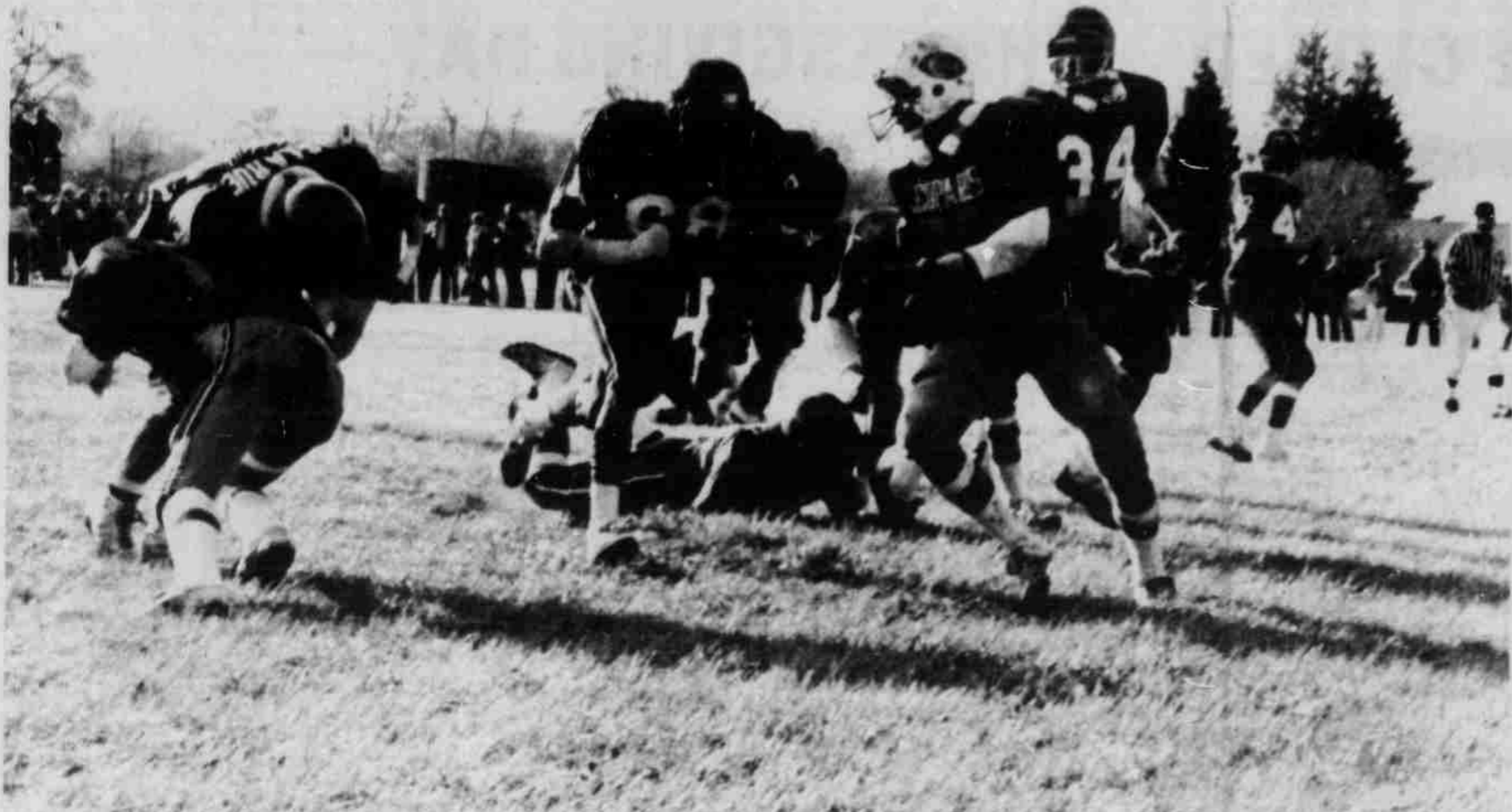
The lone Cards in action against Cove