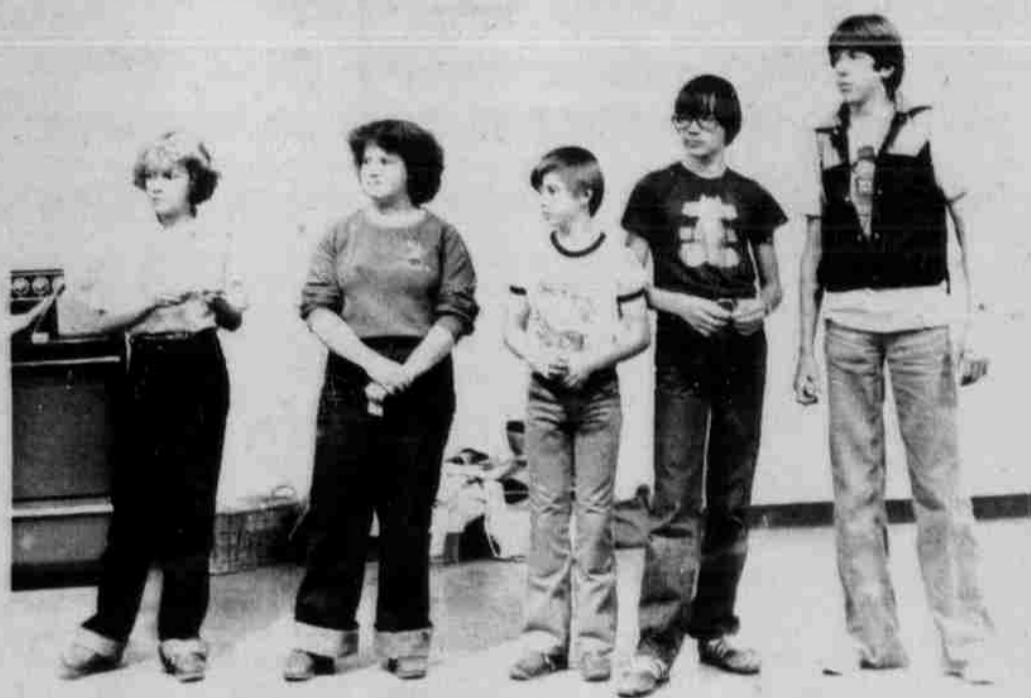
Area 4-H youth were honored with a ham dinner at the fairgrounds annex in Heppner Oct. 27.

The kids were recognized for having completed at least one year in 4-H.