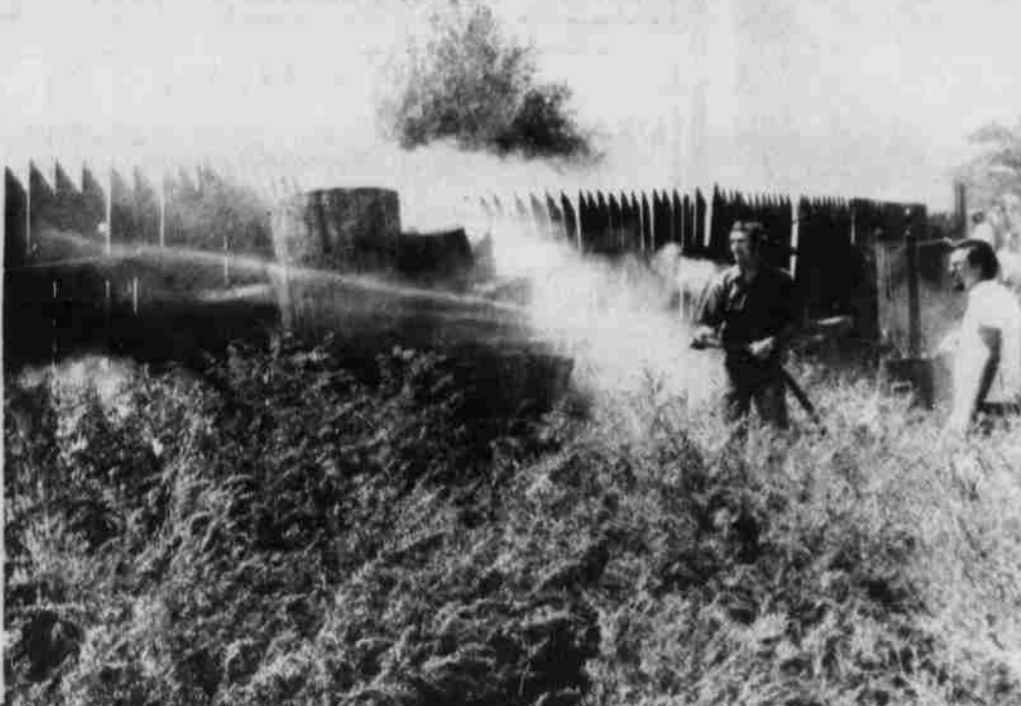
Firemen took about forty five minutes to douse the flames of a fire in Heppner Friday behind the old Bill's Body Shop building on Riverside street. The fire burned grass, part of a wood fence and some wood that was stacked there. The fire started around 1 p.m.

Closing date for positions was Tuesday, August 26, at 5 p.m.