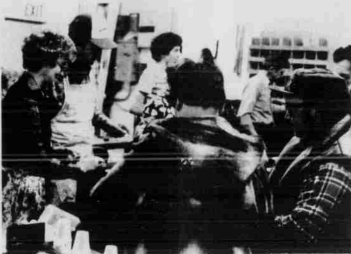
Morrow County residents were treated to a free breakfast of pancakes, ham and eggs last Saturday by the Morrow County Grain Growers on "Appreciation Day."