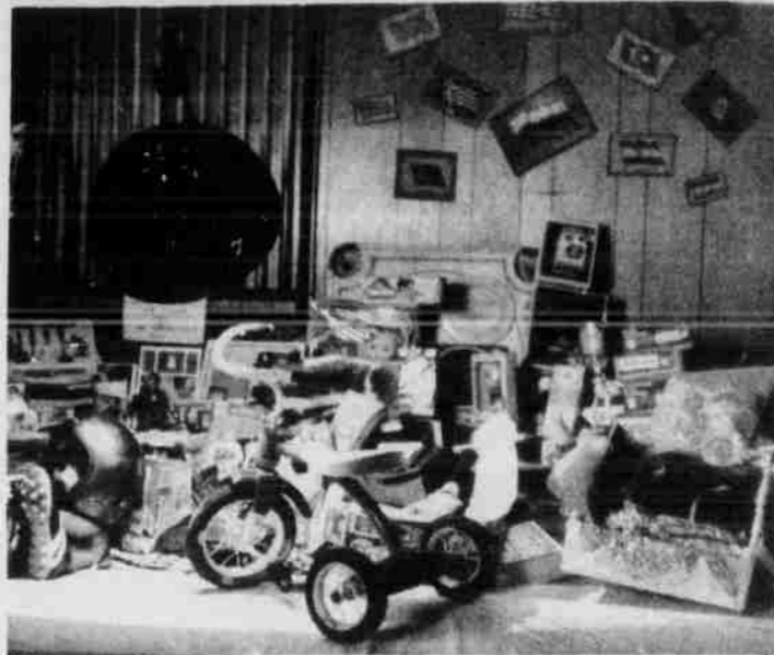
The Christmas season is over—but patrons at Bucknum's Tavern in Heppner still remember the toys that were collected there for distribution to needy youngsters in Morrow County.

Now that the holidays are over, and things are getting back to normal, I would like to take this opportunity to wish each and everyone a happy and prosperous New Year.