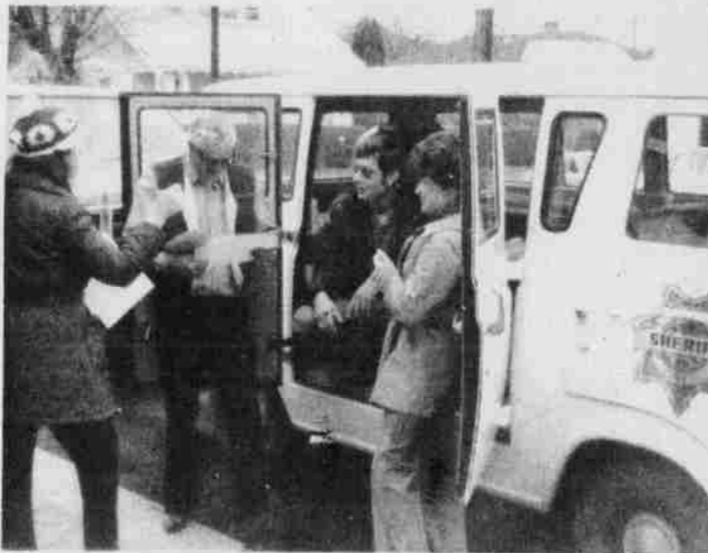
Deputies of the Morrow County Sheriff's Office helped distribute gift boxes of food, clothing and toys to needy families shortly before Christmas. Here, volunteers consult a list of people they will visit.