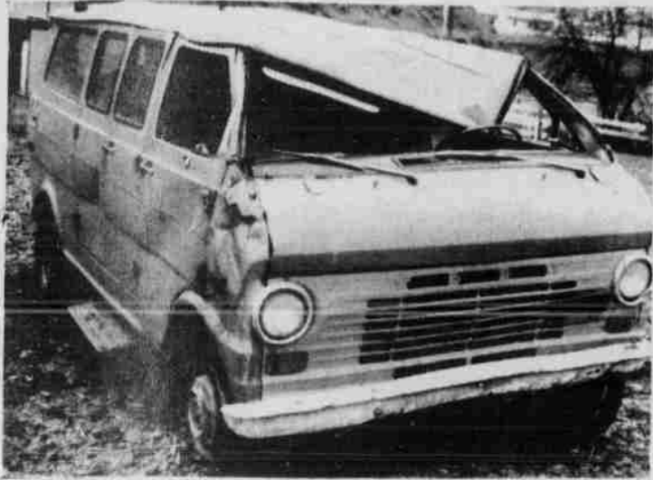
This picture of the school van shows how lucky driver Marie Keye was to escape with only minor injuries.