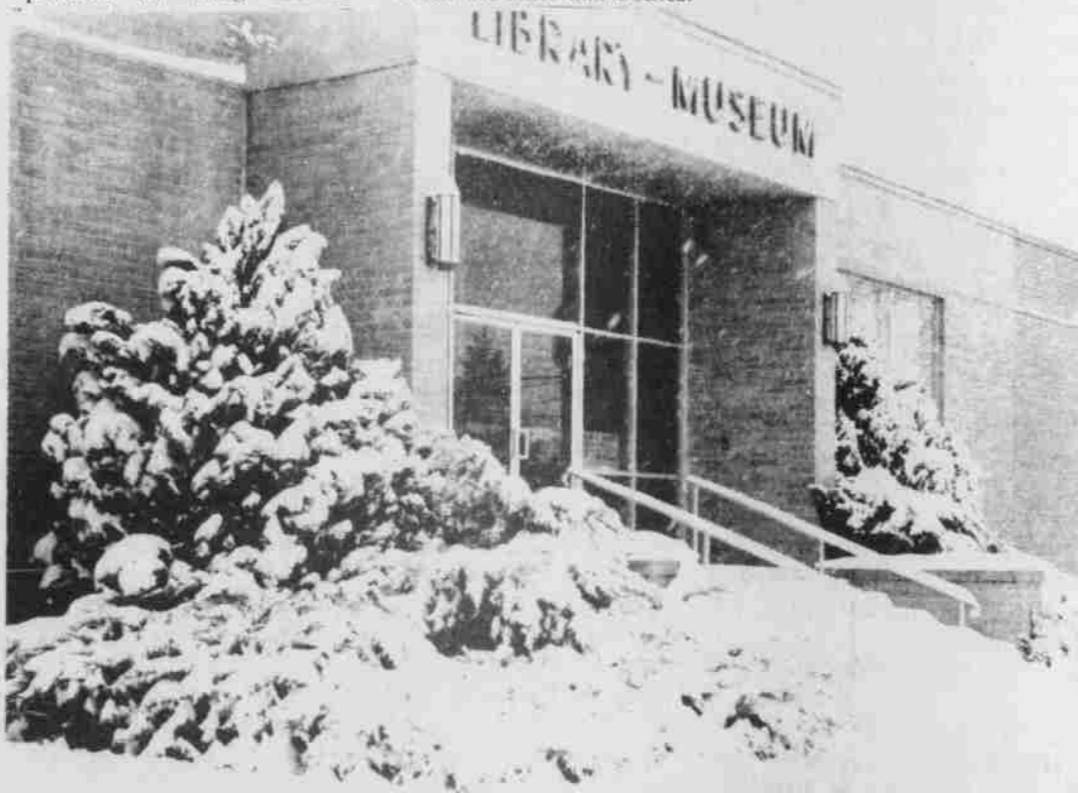
Snow showers hit the Pacific Northwest and Morrow County Monday night and it is not going to let up, according to the Weather Bureau in Pendleton. Another snow flurry is expected today with cold weather for another week and no warming trend in sight. The snow may look pretty on the trees near the library but it has been a pain for area motorists.

Volunteer fireman Clifford Green said the stove pipe in the wall was not properly insulated so the smoke started to pass through the wall surrounding the pipe.