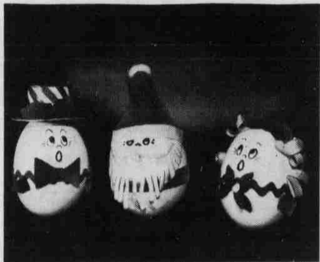
HOMEMADE TOYS using L'eggs hosiery packages are easy to make for any member of the family. A bright idea for gifts and holiday decorations.