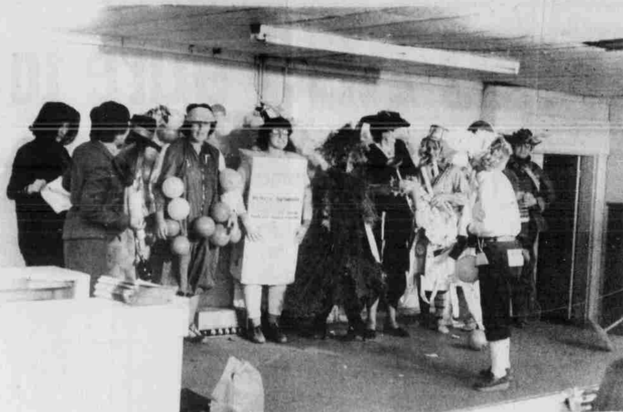
Morrow County CowBelles, the women's affiliate of the Livestock Growers organization, staged a mock style show at the annual banquet at the Morrow County Fair pavilion last Friday. About 175 persons were in attendance. Dinner was served by the Lexington Grange.