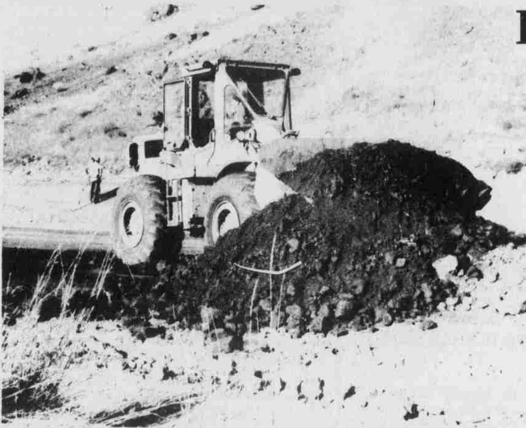
A bulldozer clears out a path for the new road. Paving is supposed to begin this week.

There will be a special Heppner City Council meeting today at 5:30 p.m. at the City Hall to discuss an ordinance which will allow the vacating of portions of Thompson Street.