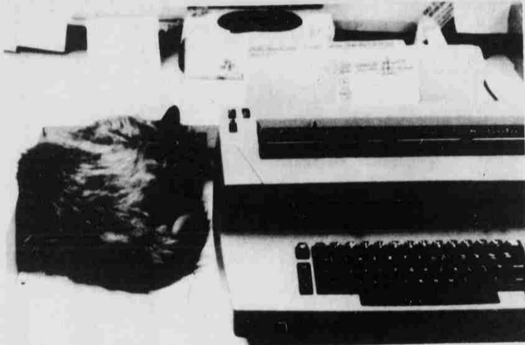
Madison grabs a quick "catnap" at the Sheriff's office next to the typewriter.

On the contrary, the court found the road to be a convenient link between two public roads and that it continues to benefit the community by remaining open.