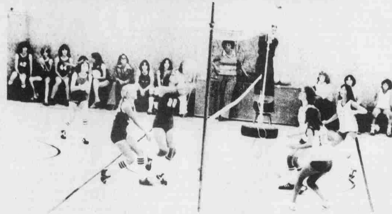
The Heppner Junior High girls' volleyball team beat Ione's squad 15-13 last week.