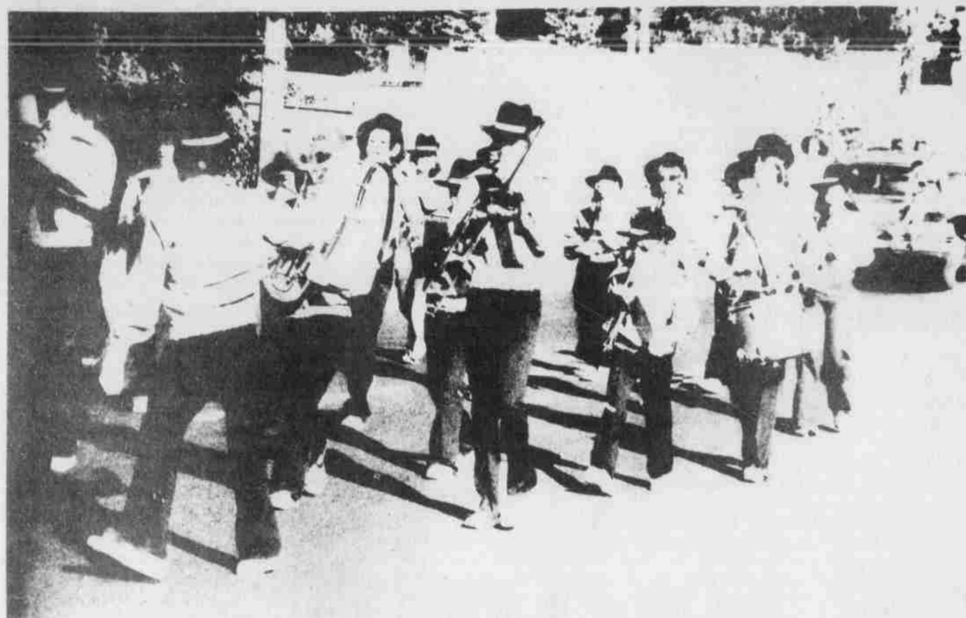
The Heppner band struts its stuff as the players show off their new uniforms. They seem to be marching to the tune of a different kind of bass drummer—he looks like a gorilla.