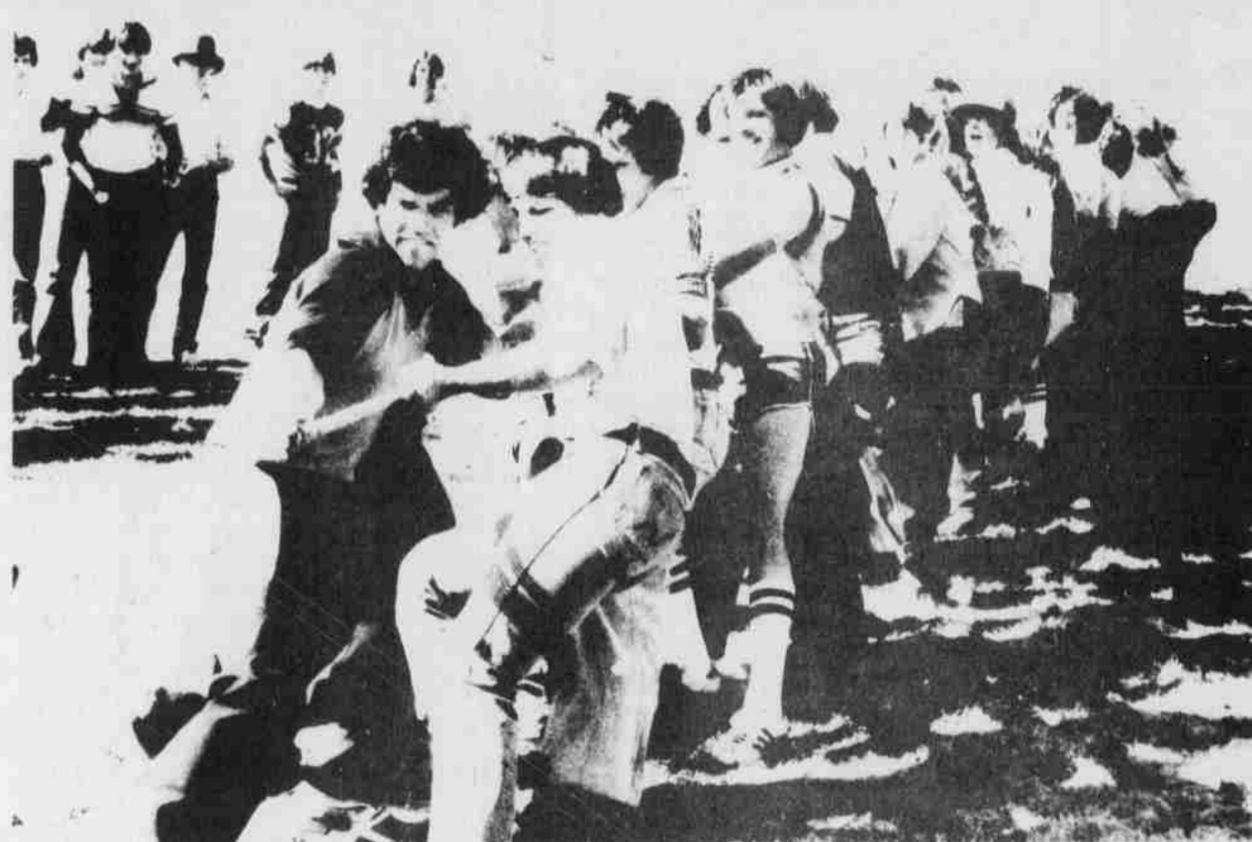
The senior tug-of-war team digs in but they easily defeated the freshman and junior challengers.