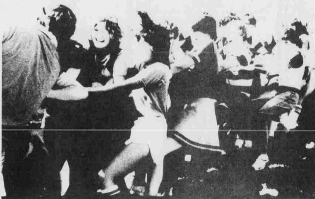
The tug-of-war was a co-ed event.