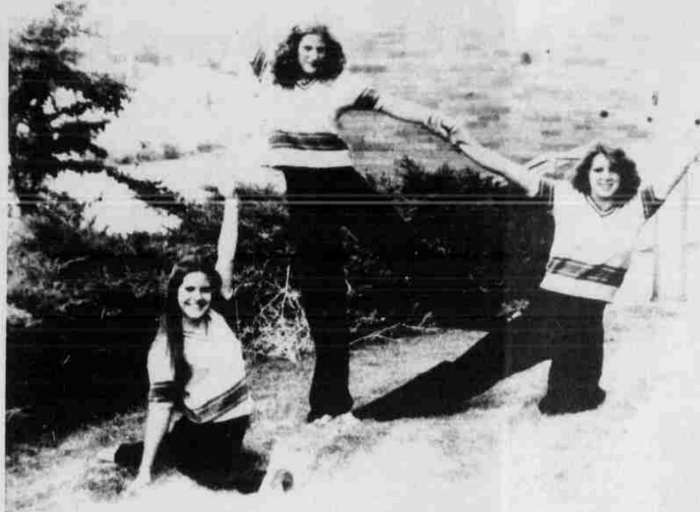
Inspiration for the team